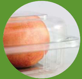
Premium clarity and presentation