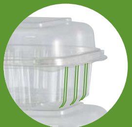
Ridges for extra strength