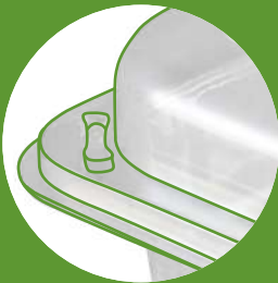
Fresh View containers have a leak resistant seal and seals in moisture