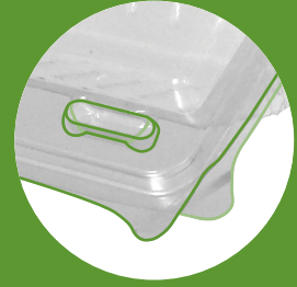
Market leading seals and tabs