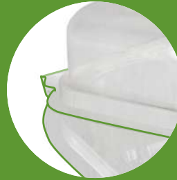
One piece, hinged construction